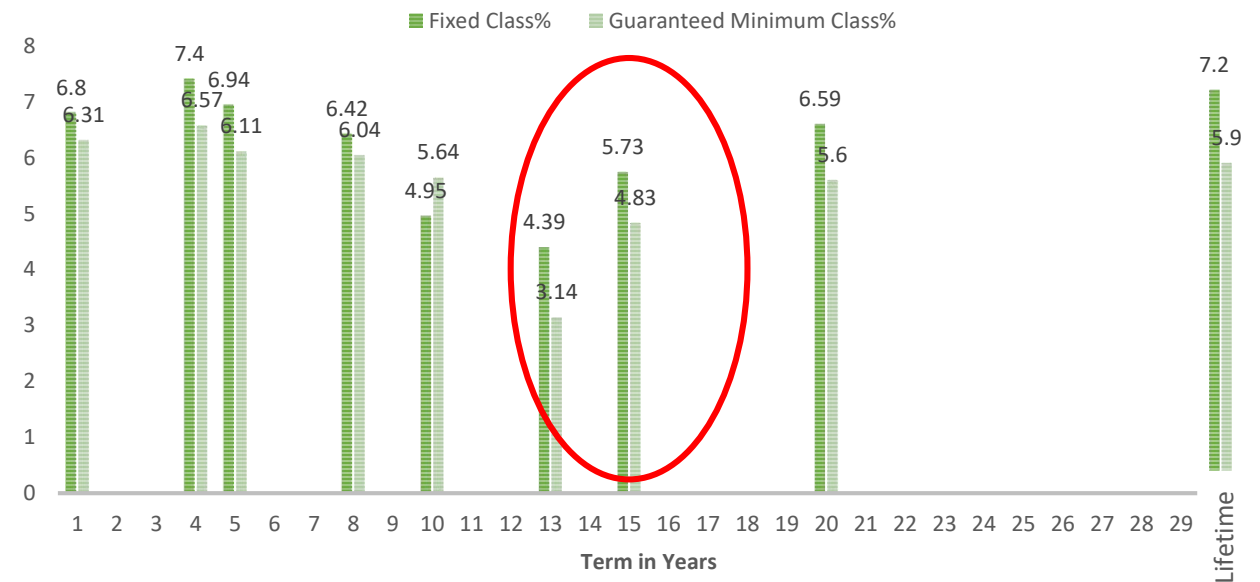
STAKEHOLDER PREFERENCES FROM POLL