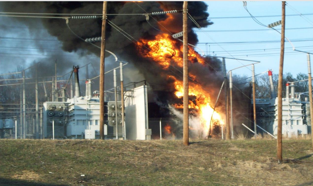
500 kV Transformer Failure in 2000