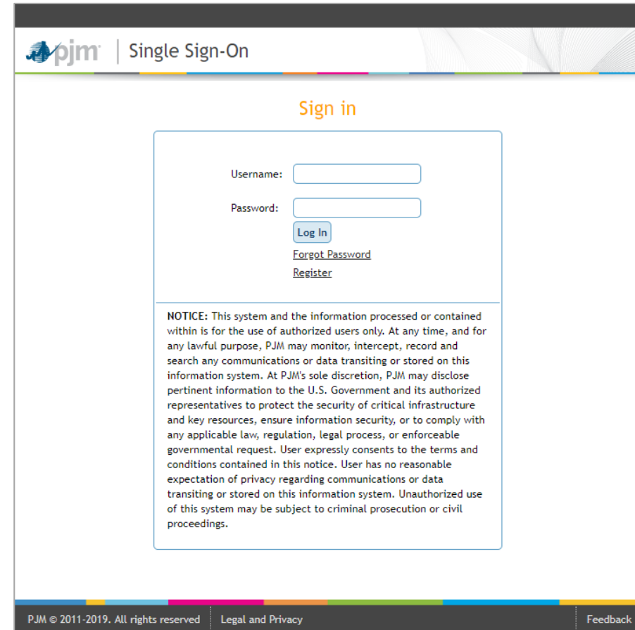
Ex. Windows Internet Explorer